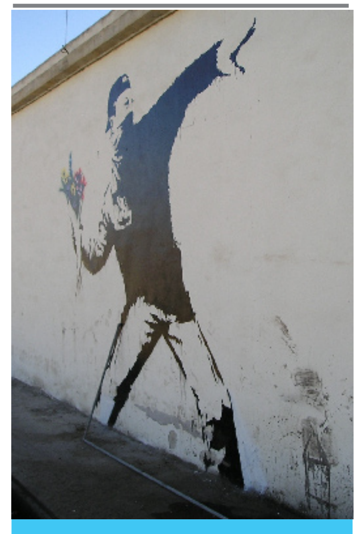
Graffiti in Beit Sahour.

diers act more violently. One of the villagers answered that the presence of international activists decreases the army brutality and this is one of the main reasons that international activists and Israelis are invited.